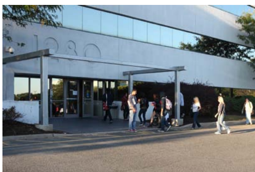
The Lyndhurst campus continues to grow with 813 students registered for Fall 2011.