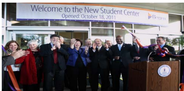
Bergen Community College and Bergen County Officials celebrate the opening of the Student Center.

On October 18, college and local officials took the wraps off the $5.5 million facility. The new Student Center not only improves access to Bergen’s main building, the Pitkin Education Center, but will provide new space for students clubs, activities, events and social gatherings.