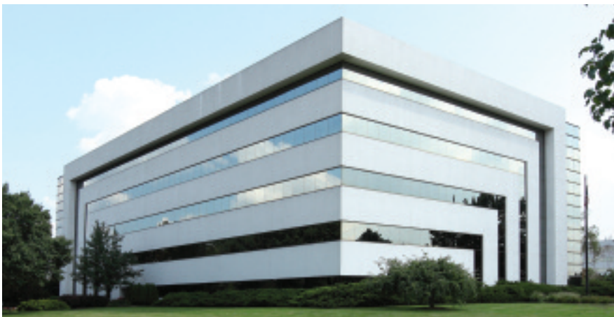
Bergen Community College at the Meadowlands will continue to be located at 1280 Wall Street West in Lyndhurst.

College buys 'interim' facility in Meadowlands region