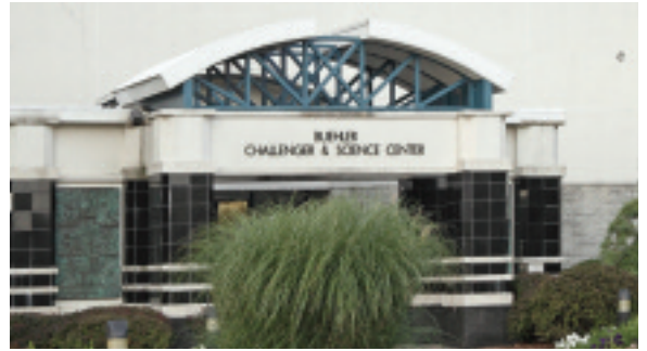
The Buehler Challenger & Science Center is located on the College's main campus in Paramus.

The sky is the limit for Bergen Community College's aviation program.